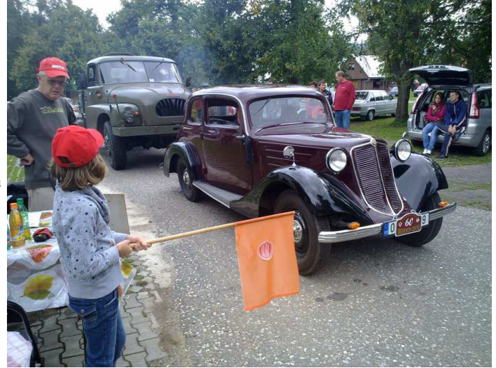
Tatra Rally tour starting line in our 1932 Tatra T54/30

We just couldn’t get enough of our Freedom Road Rally experience this past June. So, being Tatra automobile enthusiasts, we decided to attend the annual Tatra Rally on Sept. 3-5 which was held at Stredni Becva in the Czech Republic (CZ). The impressive roster of entries ranged from tiny 2-passenger 1923 T11 coupes to a humongous 8-passenger, 8-wheeled 1985 T-813 heavy duty truck, and everything in between. The Rally tour wound its way through picturesque villages to the Tatra Manufacturing Plant and museum in Koprivnice, where each car was required to