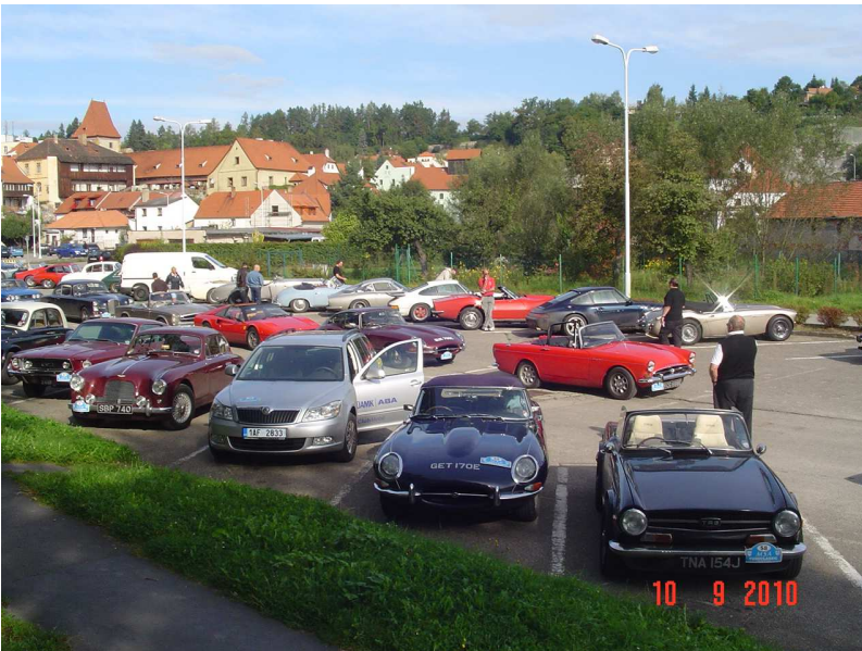
Euroclassic entrants arriving at Cesky Krumlov

Following the Rally, we began a tour of the Czech Republic’s breathtaking countryside throughout Bohemia and Moravia. We have to admit that driving a new VW Golf rental car after our Rally experience was a bit of an adjustment; but the narrow, winding roads lined with either trees or deep ditches made it a necessity. We visited the quaint towns of Telc and then Cesky Krumlov which carried you back to mediaeval times. As luck would have it, we arrived at the same time as the 92-car MSA Euroclassic Rally was pulling in for a sightseeing stop in Cesky Krumlov. The array of vintage European sports cars was mouth watering. The 8-day Euroclassic started in Nurburgring before touring through Germany, the Czech Republic, Austria and Italy, to finish at the island of Lindau on Lake Constance on the German/Swiss border. You could call it the European version of the Freedom Road Rally. Earlier, two of the cars had serious accidents which rendered them totaled, but all occupants were okay.